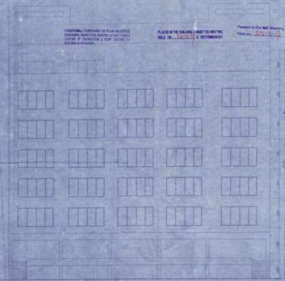
FRONT ELEVATION SCALE: 1:100