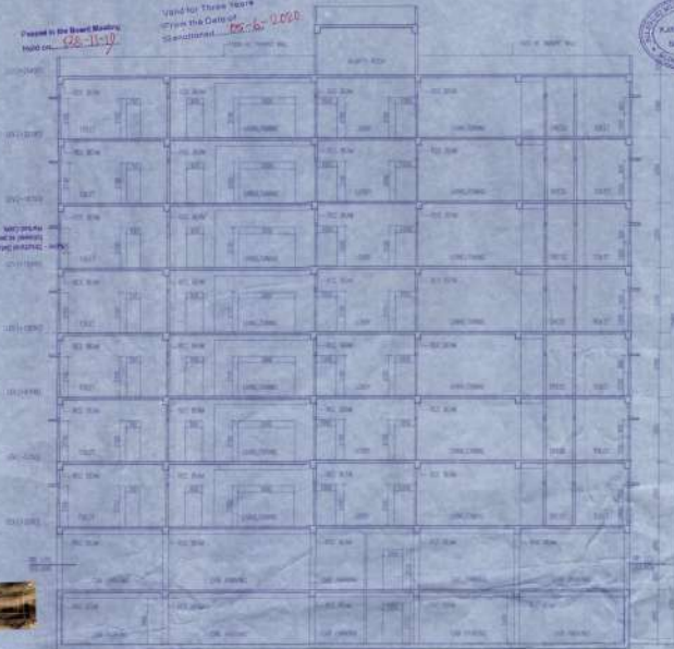
SECTION THROUGH AA SCALE: 1:100

Not to be used without the approval of the Engineer Fritam Dey